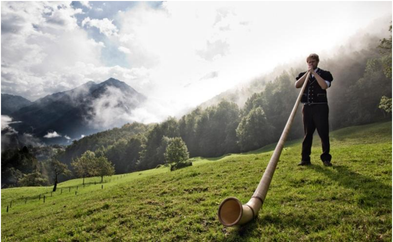
The Swiss "Alphorn", a traditional musical instrument. You may hear it at the Swiss Night on August 29!