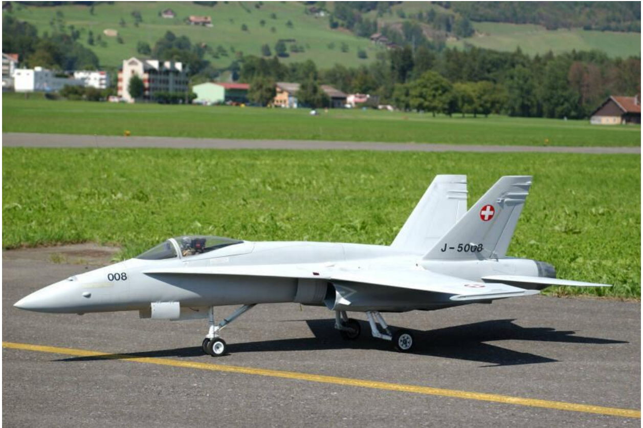
Welcome to the 10 th Jet World Masters at Meiringen Air Base, from August 21 to August 31, 2013!